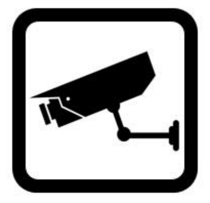
CCTV Surveillance Systems