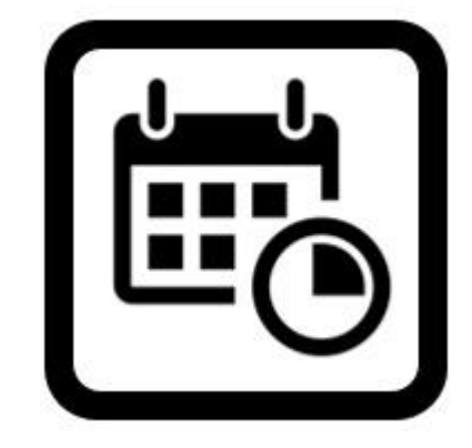
Time & Attendance